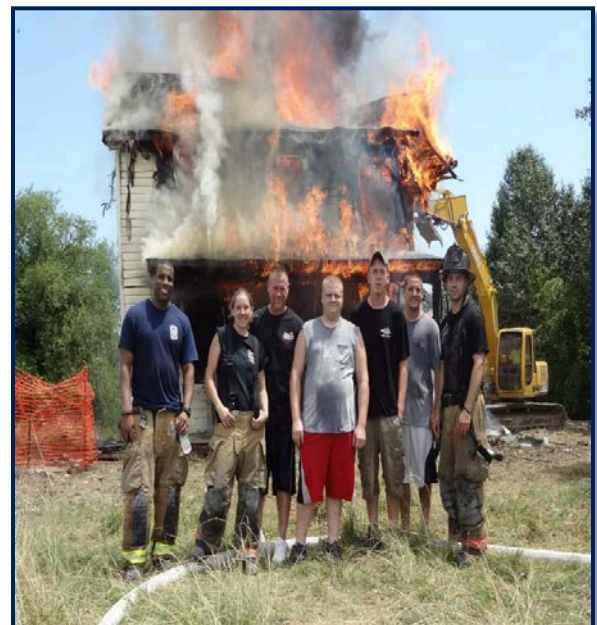
SDVFDRS Training Burn with CO.1