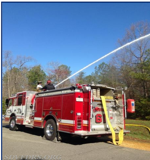
SDVFDRS Rural Water Supply Drill

After review of the ISO report, the SDVFDRS has a 2 year goal of improving the rating for training and personnel by a minimum of 50%. It is believed with improved record keeping and emphasis on department training the SDVFDRS will be well positioned to request a new ISO survey in 2016. If the goals of the department are achieved the ISO rating would improve to a 3/8B, having a significant impact on home owners insurance premiums.